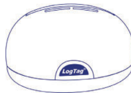
LTI-HID Not Included