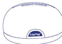
LTI HID Not Included