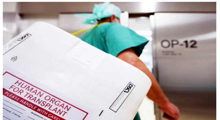
Blood & Organ Transport