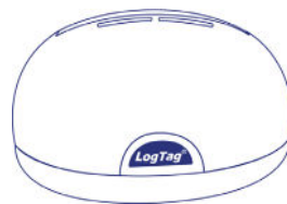
LTI-HID Not Included