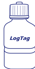
Glycol Buffer Not Included