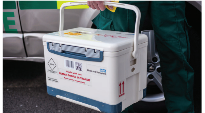
Blood & Organ Transport