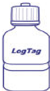
Glycol Buffer Not Included