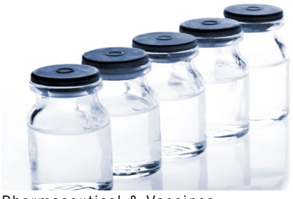
Pharmaceutical & Vaccines