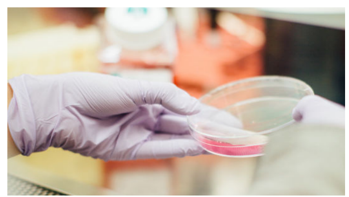
Bio-Pharma / Bio Technology