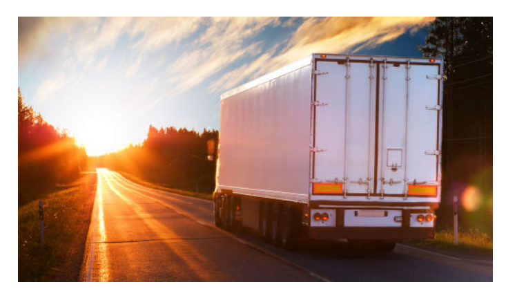
Bio Storage & logistics