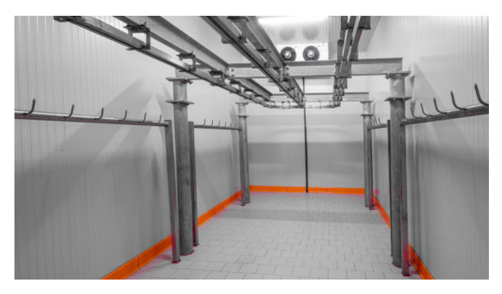
Cold Room and Storage